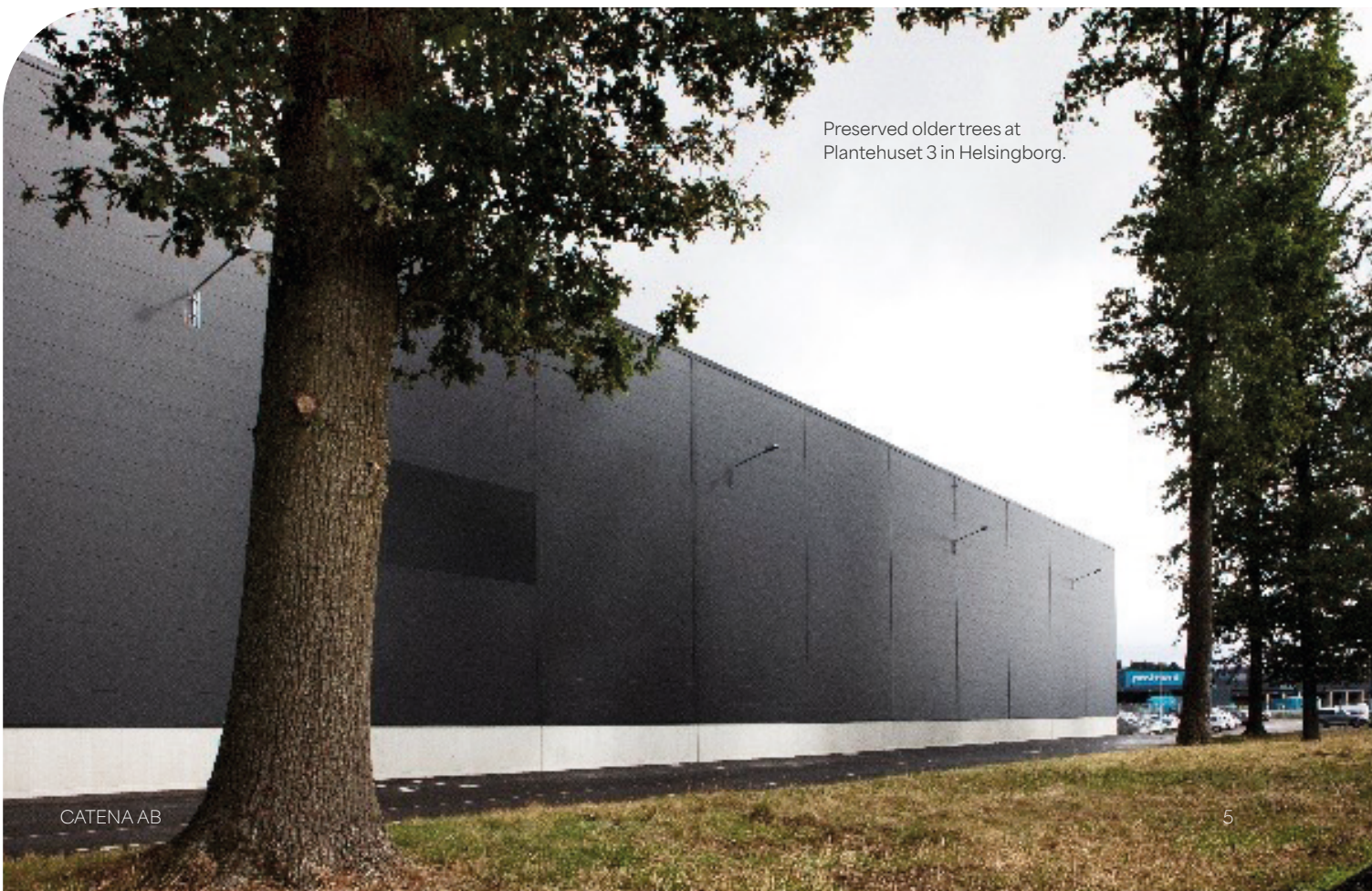
Preserved older trees at Plantehuset 3 in Helsingborg.

Catena has chosen to use GAF calculations because it is a familiar tool already used by ecologists and landscape architects and because the systematics are clear and transparent.