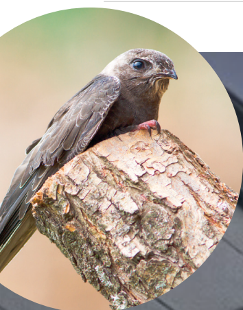
One of three kestrel nesting boxes installed at Plantehuset 3 in Helsingborg.

Green walls with plants - plant-clad walls and vertical greenery, such as flowering, self-clinging and climbing plants.