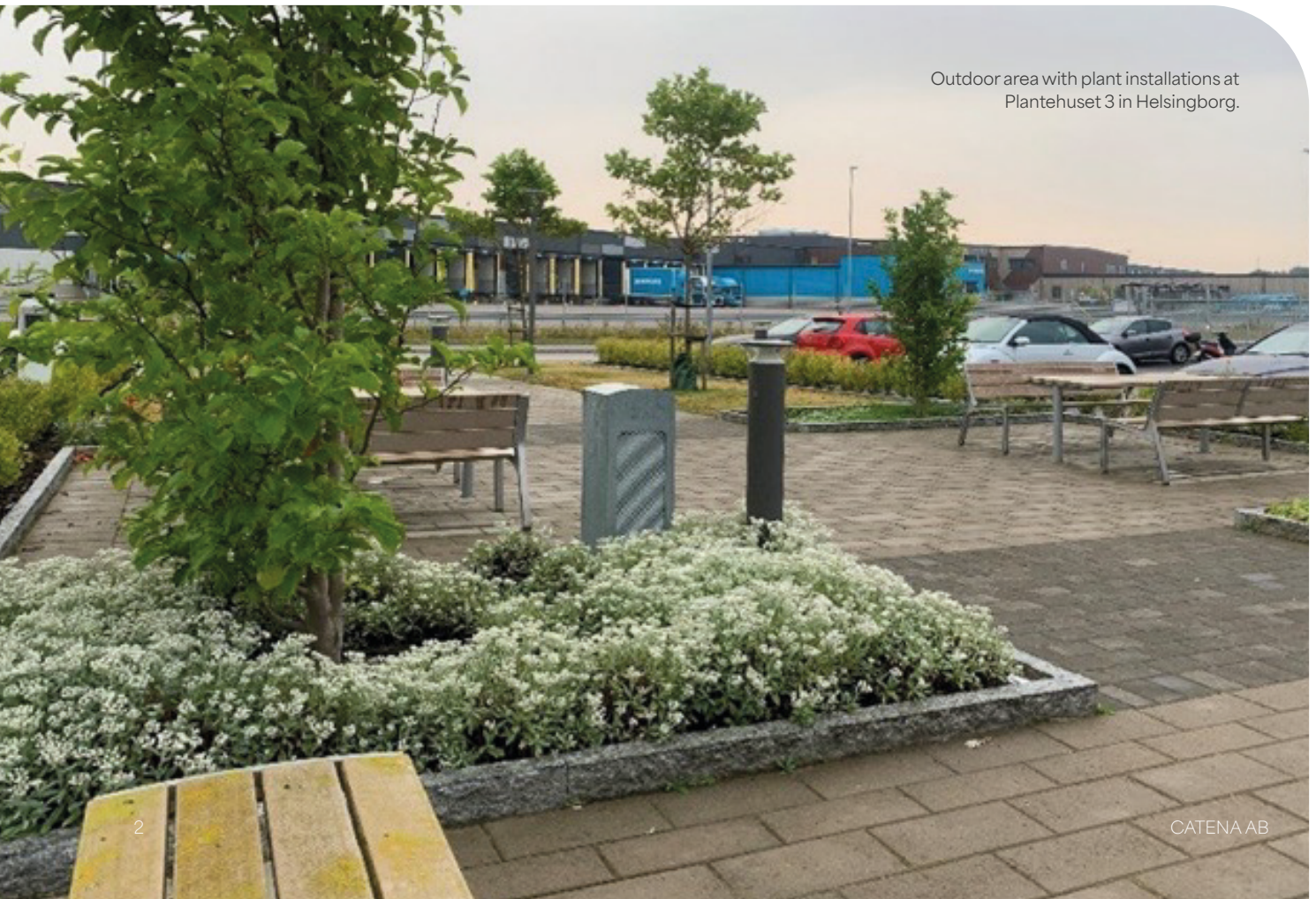
Outdoor area with plant installations at Plantehuset 3 in Helsingborg.

Thanks to the GAF calculations, Catena can plan to add and preserve green spaces and biodiversity in the early design and construction process. For existing properties, a GAF calculation was made on 31 December 2021, which was used as a base value. After measures are carried out, an additional GAF calculation is made to demonstrate progress towards our goal in a transparent way. In addition to the company’s own experts, outside ecologists and landscape architects are also engaged in order to carry out a well-founded investigation and to help with the identification of appropriate measures. A nature value inventory according to Swedish standards is always carried out before any measures are introduced at our properties.